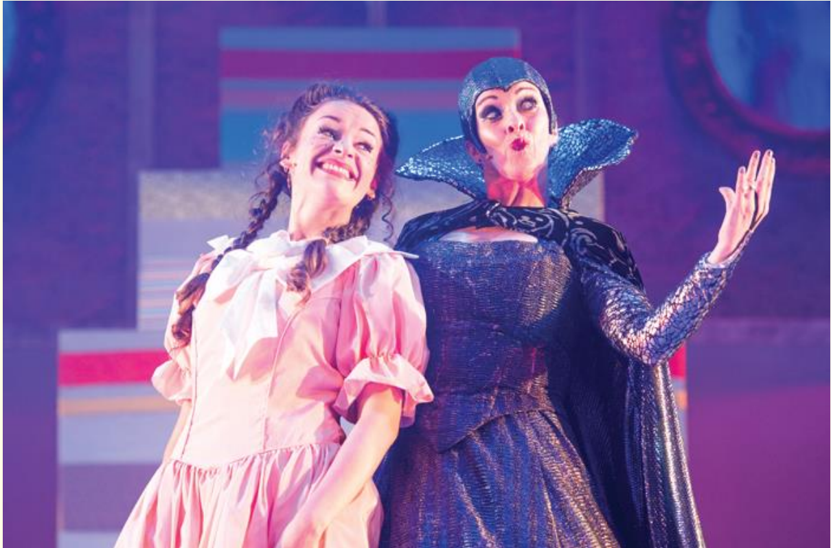
Left to right: Snow White (Goodie) and Queen Beauty (Baddie)